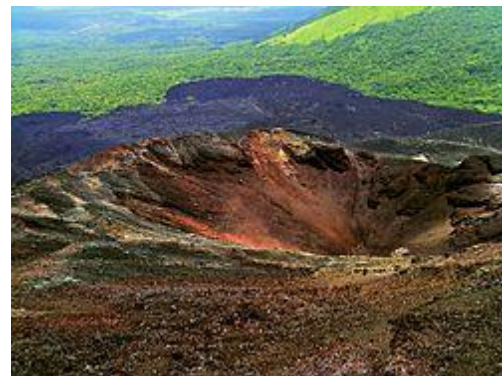
The volcano Cerro Negro.

The volcano Cerro Negro – at a distance of 17 km from León - erupted in 1995 and 1999. The effects have influenced the physical growth of the city (South and Southeast in stead of growth into the North)