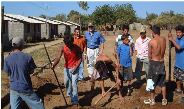
Execution of works: by involving the residents.