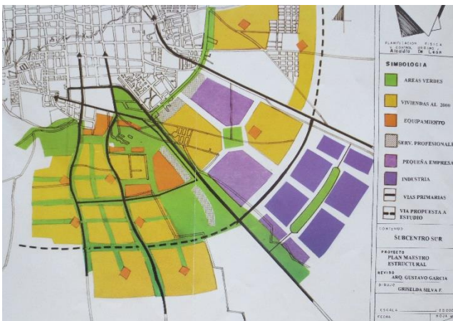
Map of the Master plan for León South East, the mayor urban expansion plan.