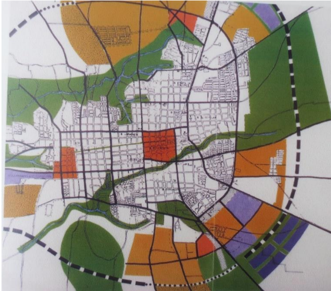
Map of the Master plan of the City of León, Nicaragua.