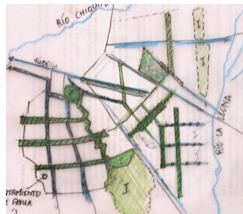
Right: Green structure